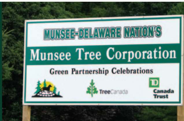
The Munsee-Delaware project helped create jobs in the green economy for First Nations youth.

TD Asset Management is a signatory to the United Nations Principles for Responsible Investing and offers three sustainability funds to retail and institutional investors.