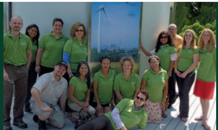
TD has over 60 Green Teams across Canada, and we're launching Green Teams for U.S. employees in 2011.