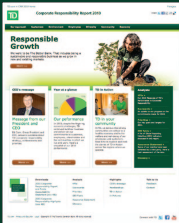
Front cover: TD employee planting during TD Tree Days.

In 2011, we will continue to develop metrics to demonstrate a clear link between these priorities and our performance.