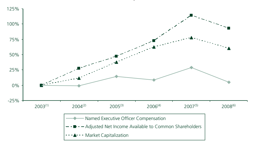
Since 2003, the total compensation awarded to the Named Executive Officers grew 5%, compared to growth in Market Capitalization of 60% over the same period and growth in the Adjusted Net Income Available to Shareholders of 93% over the same period.

The following graph illustrates the change in total compensation awarded to Named Executive Officers compared to the change in Adjusted Net Income Available to Common Shareholders and Market Capitalization since 2003.