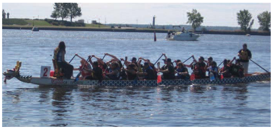
To generate much-needed funds for the Cedars Cancer Institute in Montreal, three boats filled with TD employees entered a dragon boat race fundraiser.