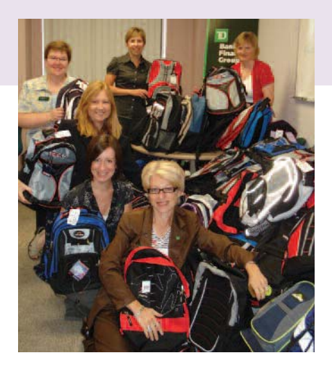
For London-area children in need, TD employees assembled 575 new backpacks filled with school supplies and provided them to local schools and social agencies. Supplies were collected through donations and purchases.