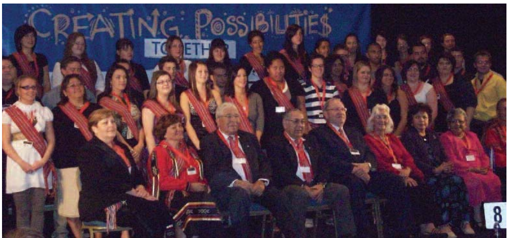
In Edmonton, TD was one of the sponsors of the Belcourt Brosseau Métis Awards, established to help Métis Albertans realize self-sufficiency through education and skills development.

In our 2009 Diversity Inclusiveness Survey, 89% of respondents indicated they felt TD was inclusive – 3% more than in 2007. We have diversity and employment equity policies in place and provide diversity training to employees and executives – by the end of 2009 more than 6,000 of our people managers (representing over 90% of all managers in Canada) had completed Embracing Diversity training.