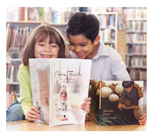
Children reading the winning books of the 2009 TD Canadian Children's Literature Award.