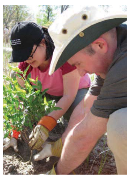
Taking time away from investing in the markets to invest in the environment, some 30 TD Mutual Funds employees planted close to 150 trees on Toronto Island