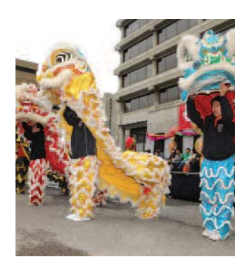
Our Chinatown branch in Calgary was once again a Gold Sponsor of the Chinatown Street Festival.